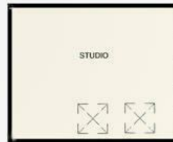
COACHHOUSE 1ST FLOOR AREA 289 SQ.FT. (26.9 SQ.M.)